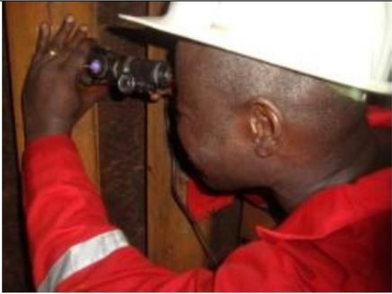
BRACON-TURRET STAFF CARRYING OUT INSITU-METALLOGRAPHY AT WRPC