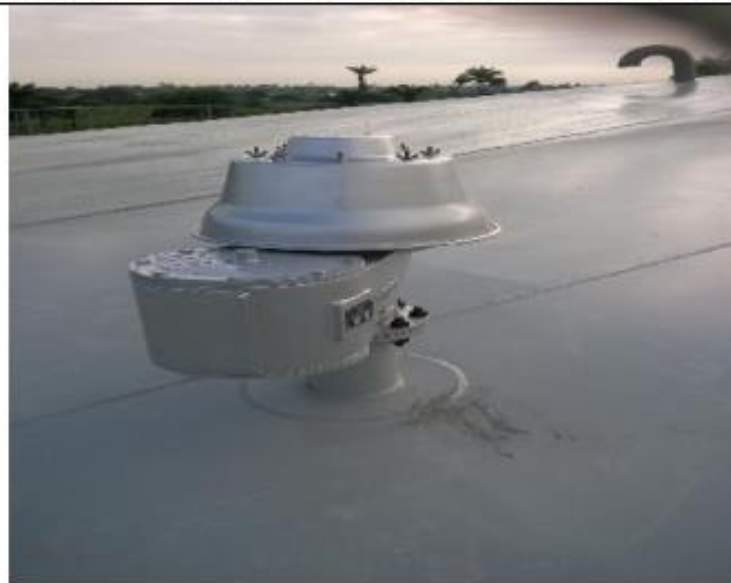
ATECO PVRV INSTALLED BY BRACON ON ENERGIA 30,000 BBL CRUDE STORAGE TANK