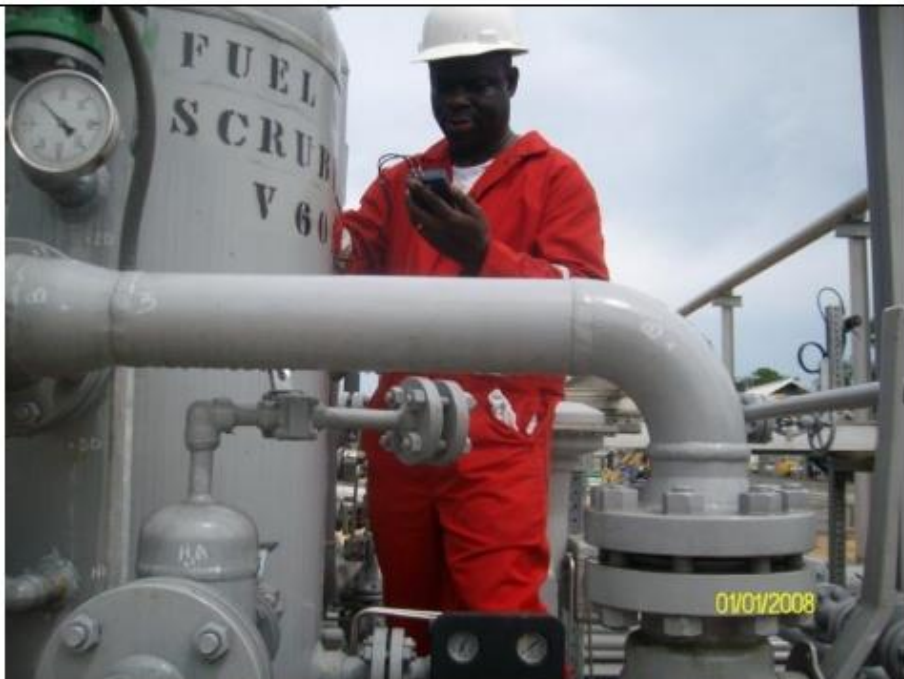
BRACON-TURRET CARRYING OUT NDT AT SPDC EPF PROJECT AT GBARAN UBIE