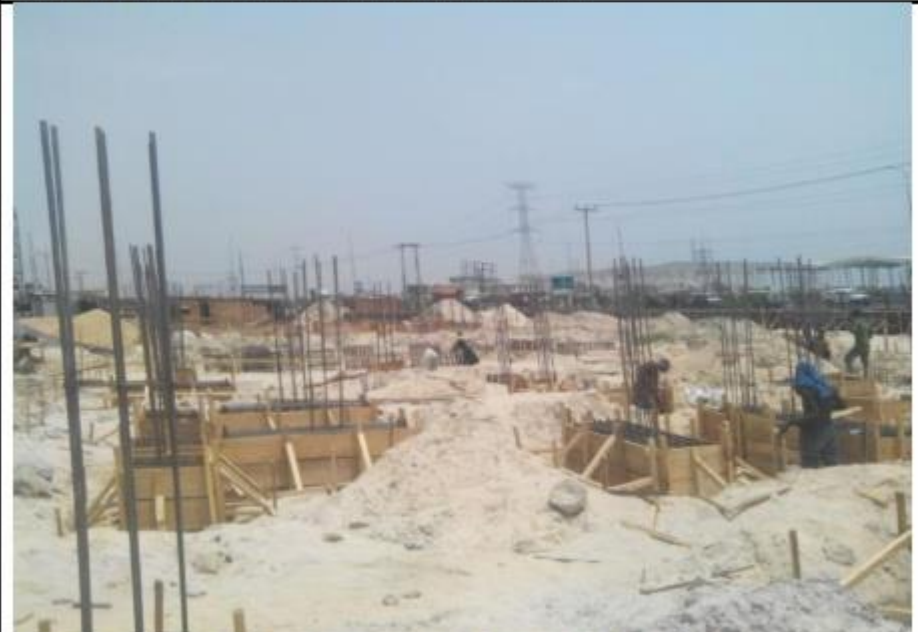
CONSTRUCTION OF FOUNDATION AT LAGHOMS PROJECT, LEKKI