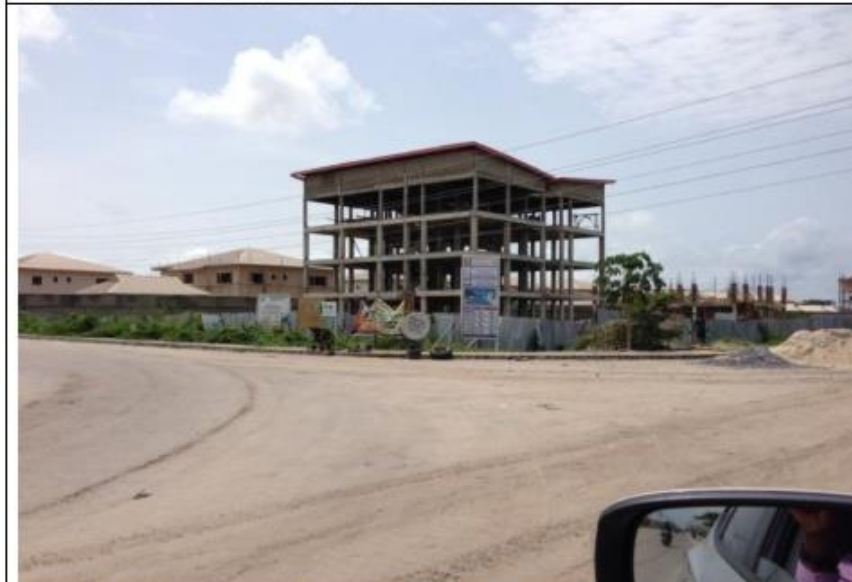
CONSTRUCTION OF 4NOS THREE STOREY BUILDING AT LAGHOMS PROJECT, LEKKI