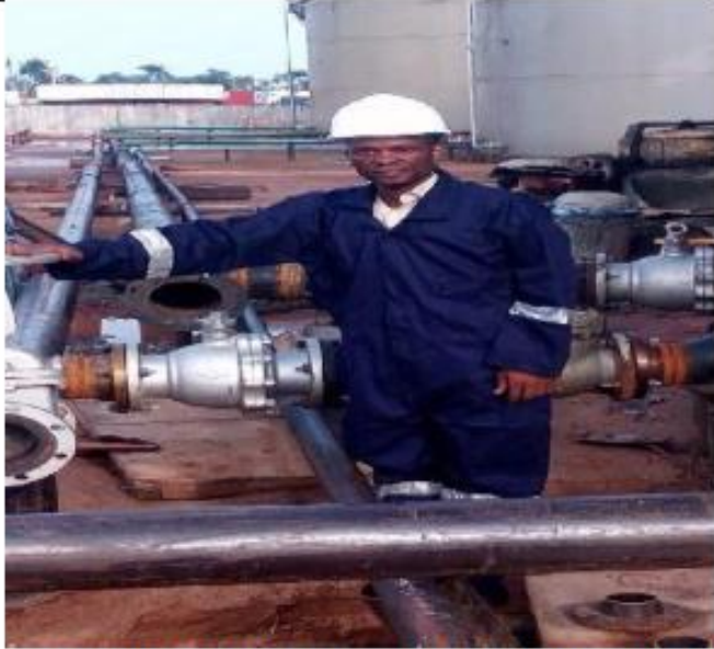
ENERGIA 30,000 BBL TANK PRODUCT PIPING DURING CONSTRUCTION BY BRACON