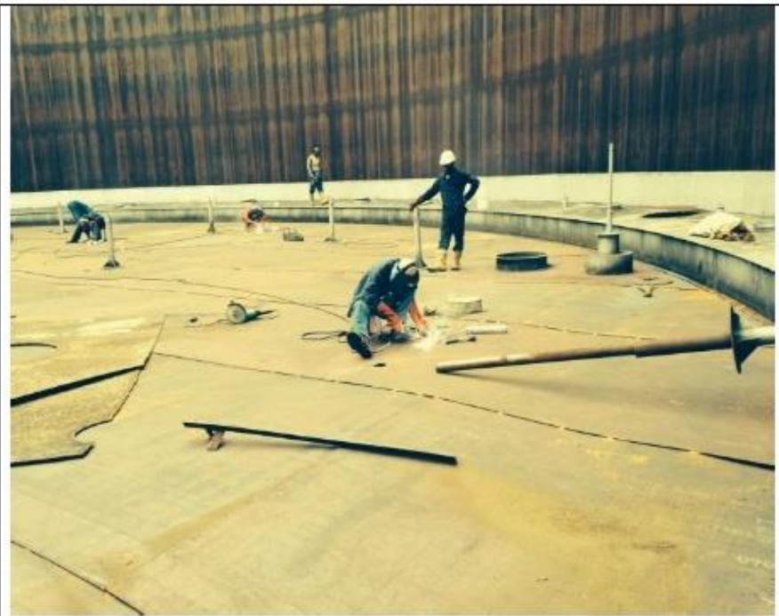
BRACON-TURRET STAFF REPLACING THE CETER DECK OF PHRC CRUDE TANK