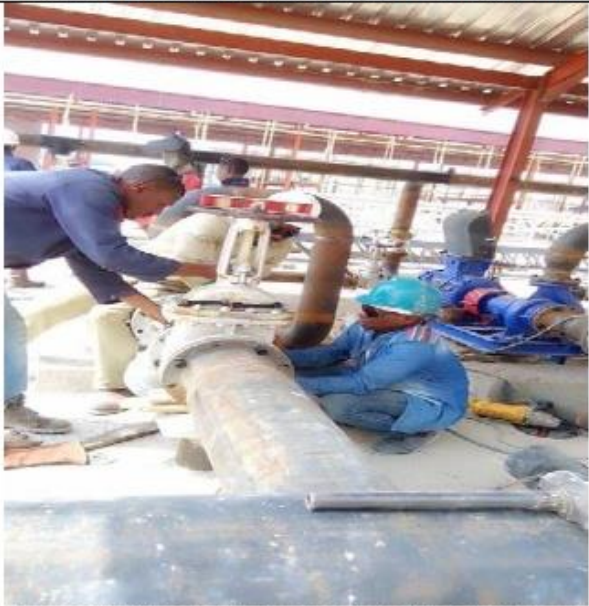
BRACON-TURRET STAFF FABRICATING SYNOD PET. PRODUCT PUMP HOUSE