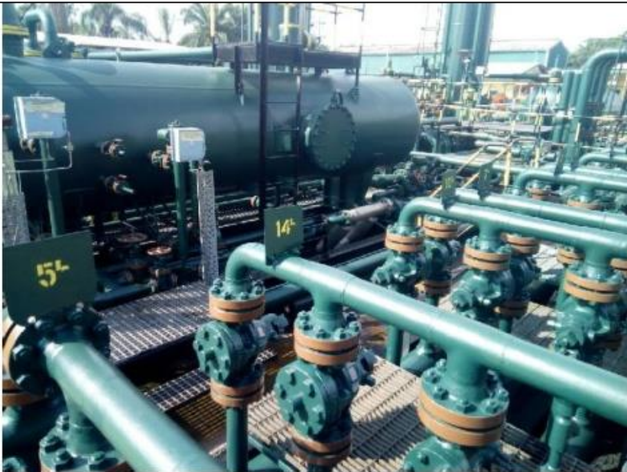
AFESERE FLOW STATION MANIFOLD REHABILITATED BY BRACON-TURRET