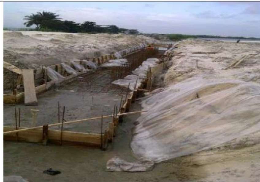
PIPP RETAINING WALL WORKS IN LEKKI