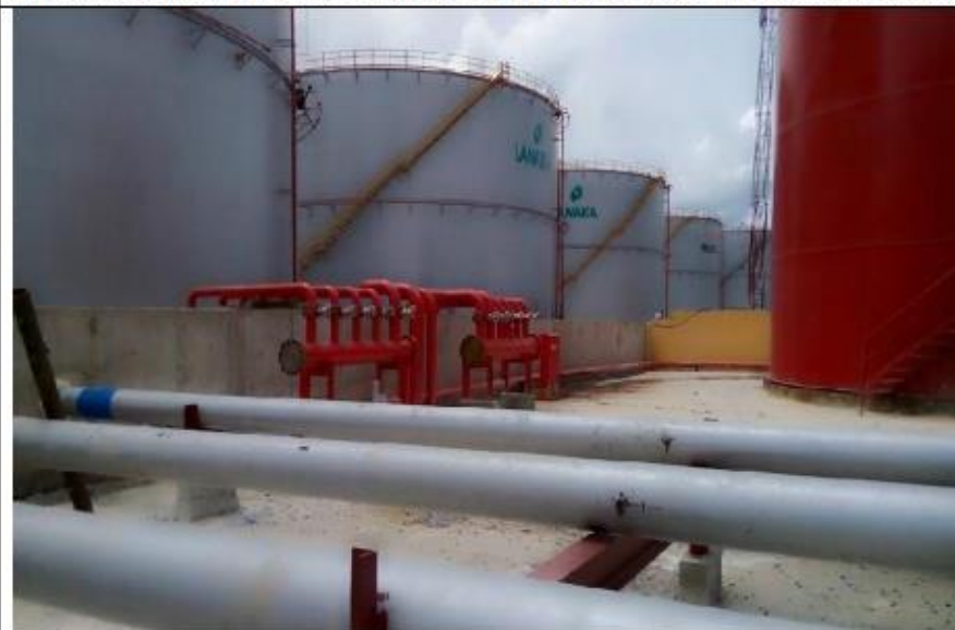
LANAKA PRODUCT TANK & PIPING CONSTRUCTED BY BRACON-TURRET