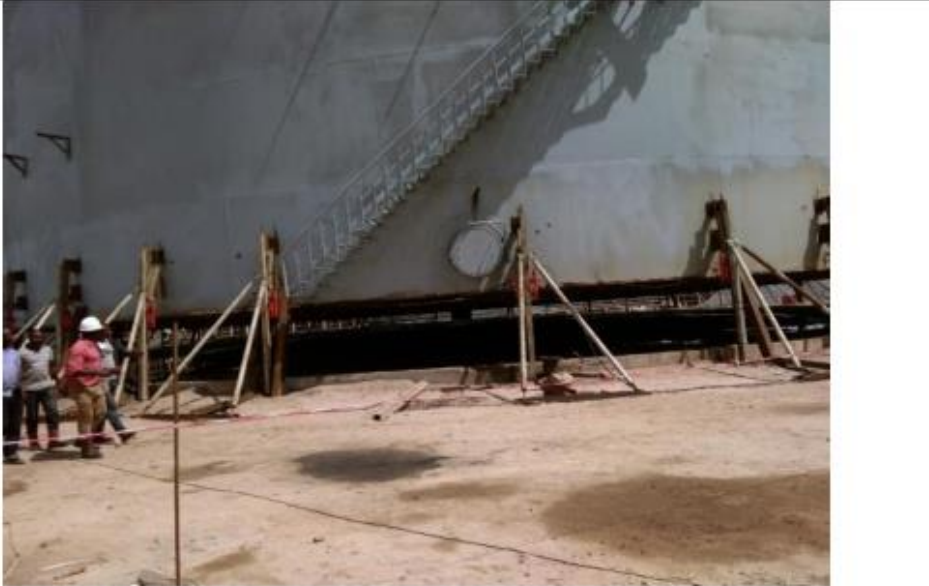
BRACON-TURRET BYGGING JACK IN ACTION