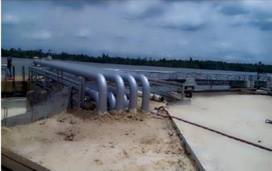
PINNACLE CARGO PIPELINES CONSTRUCTED BY BRACON-TURRET