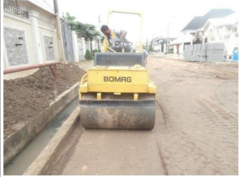
ORIWU ROAD SAND FILLING WORKS BY BRACON