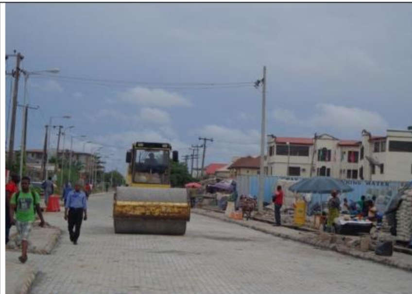
COMPACTION OF ORIWU ROAD BY BRACON