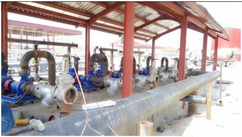
PINNACLE PRODUCT PUMP HOUSE FABRICATED BY BRACON-TURRET