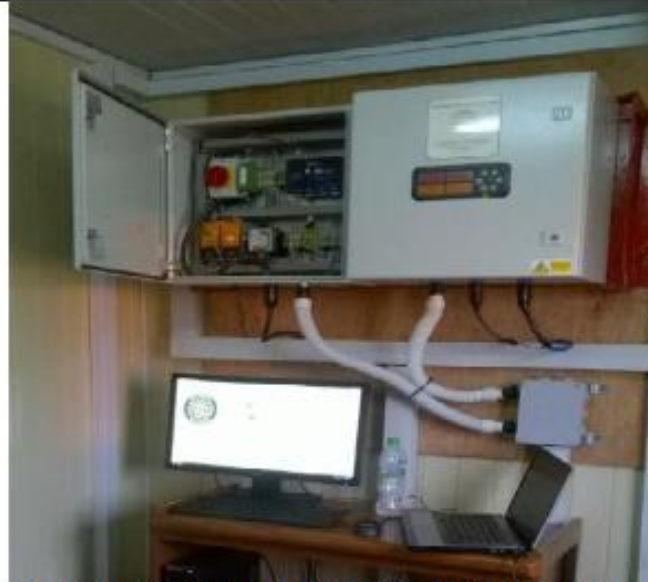
AUTOMATIC TANK GAUGING SYSTEM MONITOR IN ENERGIA CONTROL ROOM INSTALLED BY BRACON