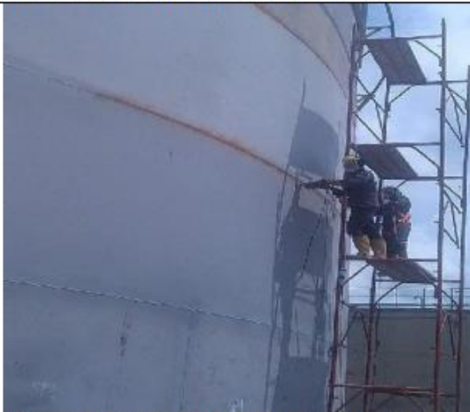
BRACON STAFF PAINTING ENERGIA 30,000 BBL CRUDE STORAGE TANK