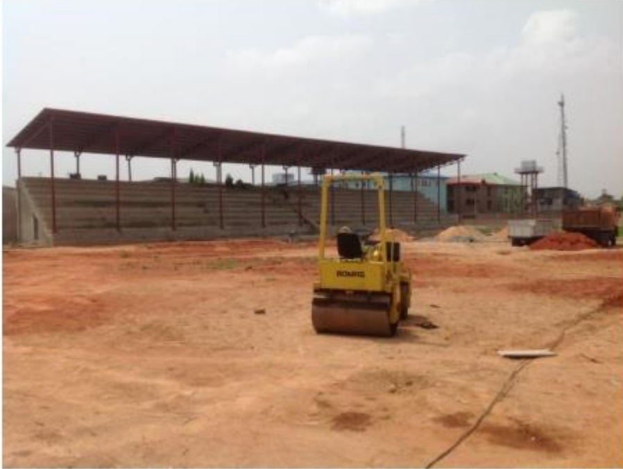
IFAKO MINI STADIUM COMPLEX CONSTRUCTED BY BRACON