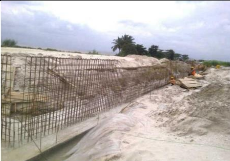
PIPP RETAINING WALL AT LEKKI WHILE UNDER CONSTRUCTION BY BRACON