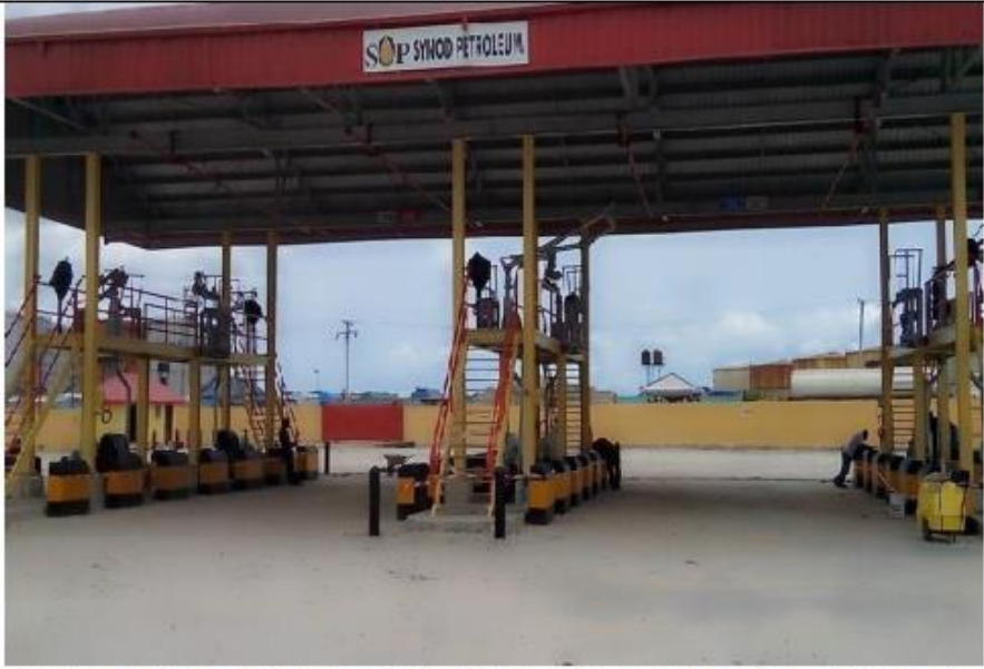
SYNOD PETROLEUM LOADING GANTRY CONSTRUCTED BY BRACON-TURRET