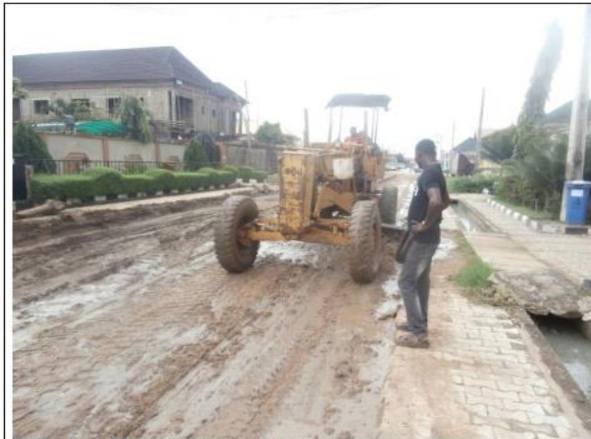
CONSTRUCTION OF ORIWU ROAD BY BRACON