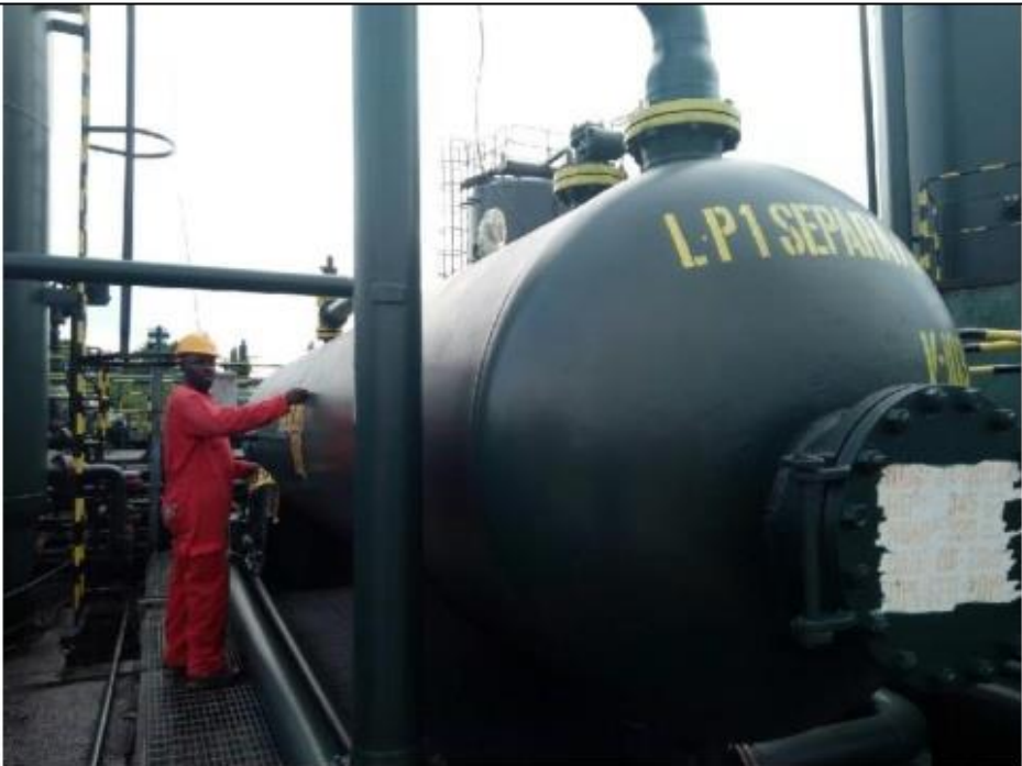
LP SEPARATOR IN AFESERE FLOW STATION REHABILITATED BY BRACON-TURRET