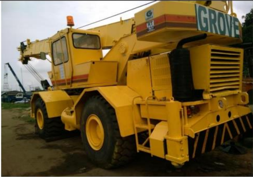
BRACON-TURRET 30TONS ROUGH TERRAIN GROVE CRANE